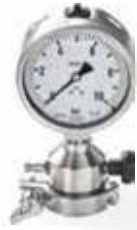
VENT TC 1.5" VALVE + CLAMP