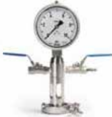
VENT TC 1.5" SIGHT GLASS 2 BALL VALVES + CLAMP