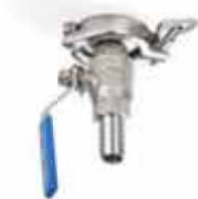
BALL VALVE TC 1.5" + CLAMP