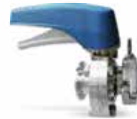
BUTTERFLY VALVE TC + CLAMP